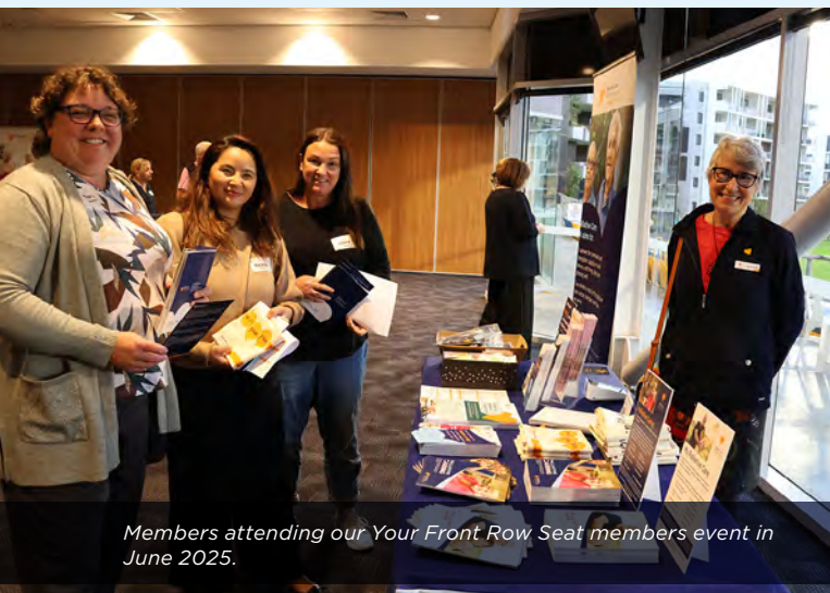
Members attending our Your Front Row Seat members event in June 2025.