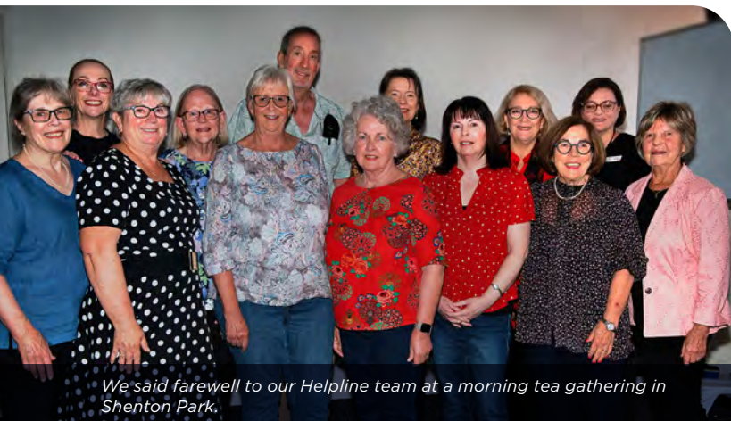
We said farewell to our Helpline team at a morning tea gathering in Shenton Park.

The booklets are free and have been made possible through generous funding via the Greater Choices for at Home Palliative Care, an Australian Government initiative implemented by WA Primary Health Alliance in WA.