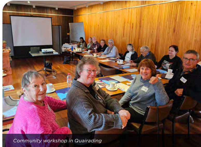
Community workshop in Quairading

Workshops are instrumental in enabling individuals to complete an Advance Health Directive (AHDs) correctly and this has been enhanced by the reinstatement of the ACP Support Service (see page 8 for further details about this service).