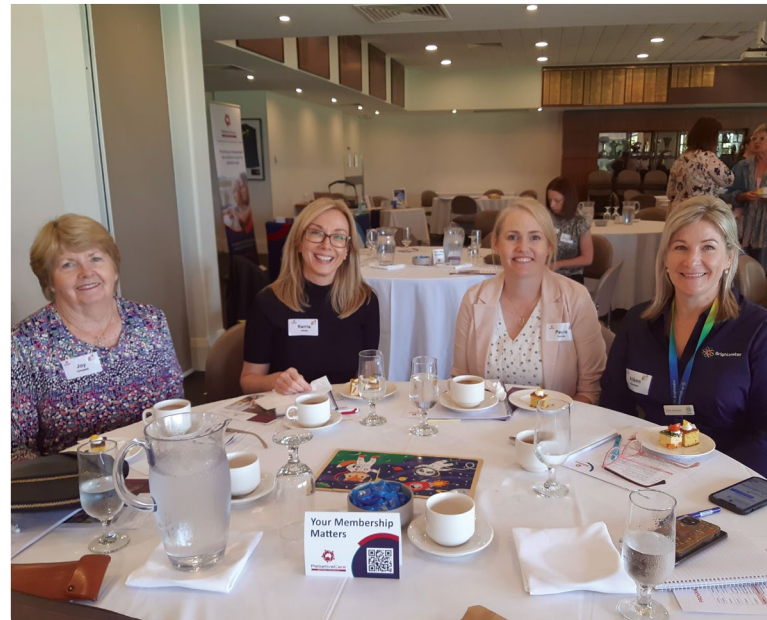
Attendees at the volunteering consultation.

The in-person and online event attracted 54 participants and covered all aspects of palliative care volunteering and included workshops and presentations from local and national leaders in the volunteering and palliative care sectors. Seven attendees volunteered to be part on an on-going steering group which has met monthly since the event to progress a strategic plan and terms of reference for the group.