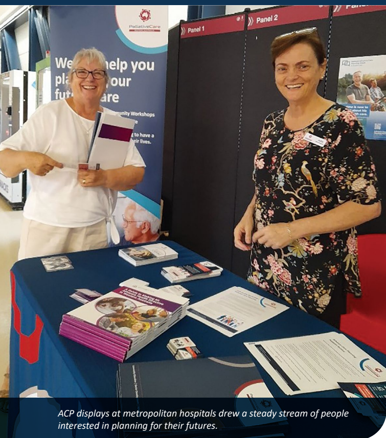
ACP displays at metropolitan hospitals drew a steady stream of people interested in planning for their futures.